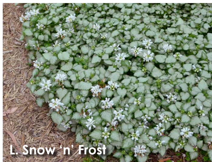
L. Snow 'n' Frost