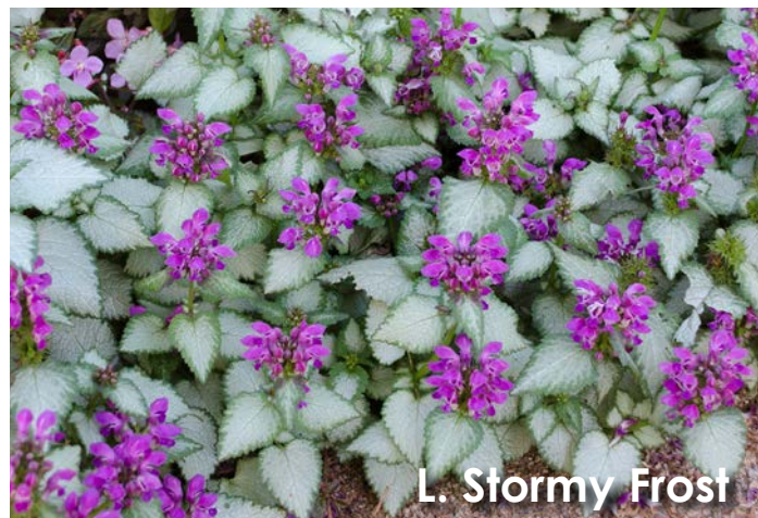
L. Stormy Frost

Grows well in most soils that are moist but well draining. Do not allow to dry out over extended periods of heat. No pruning required although a light trim can be given during early spring to shape. An addition of a slow release fertiliser in spring recommended. Frost tolerant.